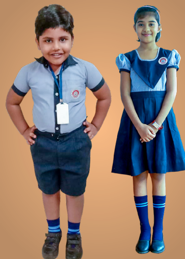
Class III, IV & V