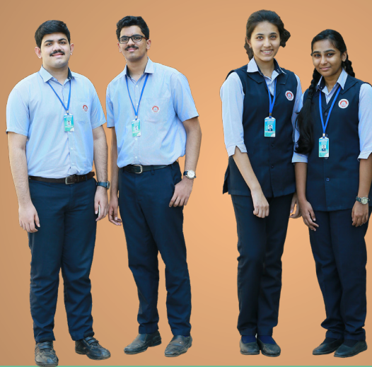
Class XI & XII