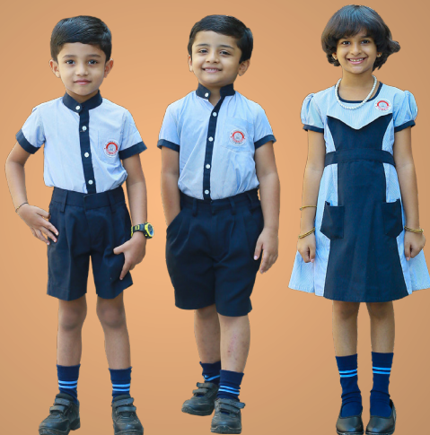
Play, LKG, UKG, Class I & II