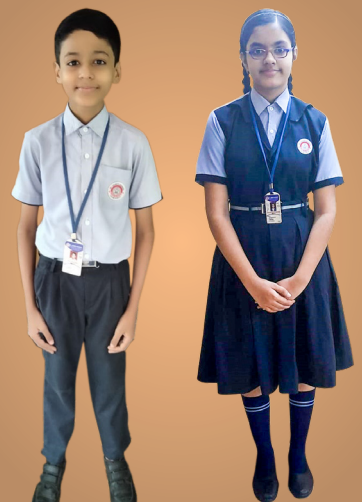
Class VI, VII & VIII