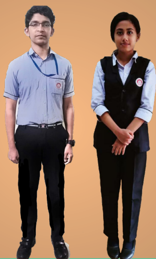
Class IX & X